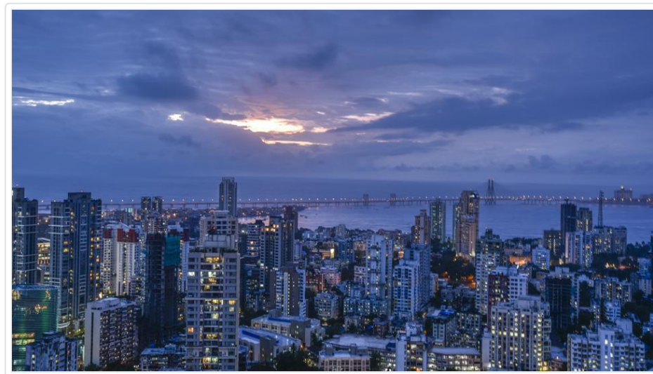
The idea of making Mumbai a 'super city', flush with skyscrapers that play hide and seek with the clouds, by increasing the FSI may be a necessity. (Representational photo)

f The Development Plan (DP, 2034) for Mumbai released by the state government on Wednesday – after months of debate, discussion and dithering – has evoked mixed reactions from different quarters. t in